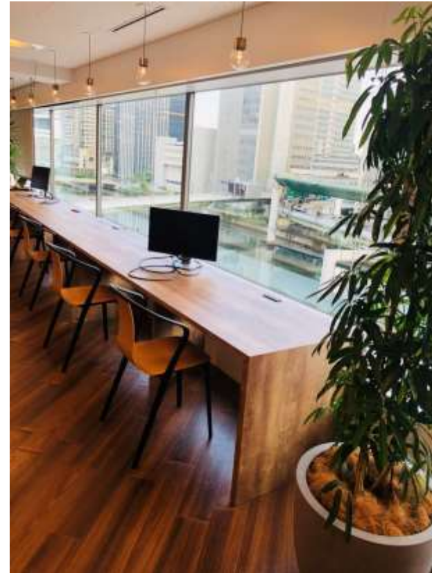
Lounge with wide view